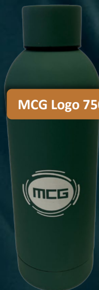
MCG Logo 750ml Drink Bottle