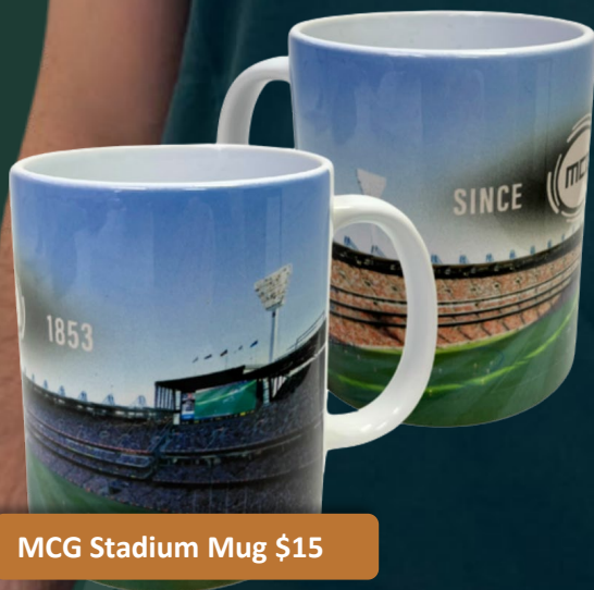
MCG Stadium Mug $15