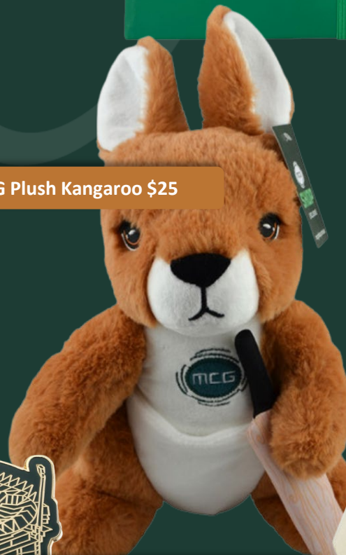
MCG Plush Kangaroo $25