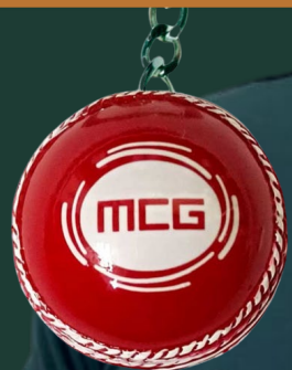
MCG Cricket Ball Keyring $12