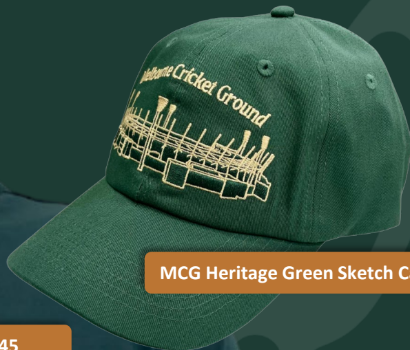
MCG Heritage Green Sketch Cap $30